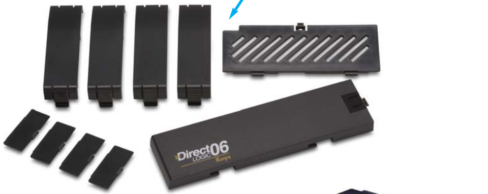
DL06 replacement terminal blocks, terminal block covers, terminal block labels and short bar D0-ACC-2