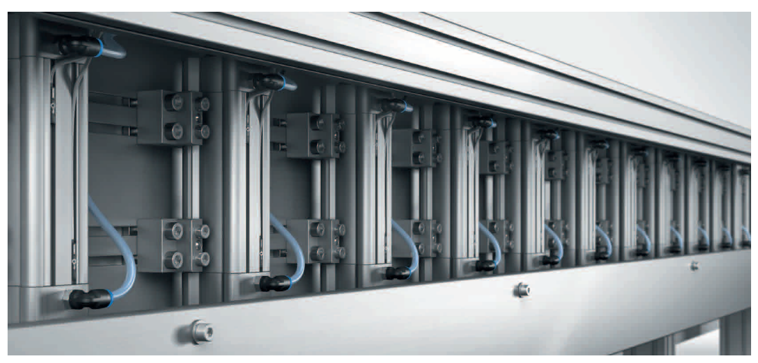
DSBC-PPS in use: DSBC is always correctly adjusted, even in synchronous running or when it is hard to access.